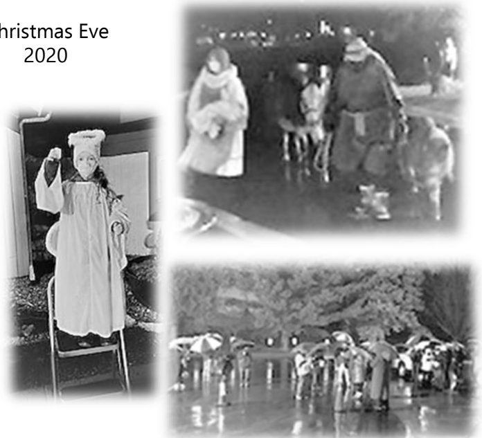
Christmas Eve 2020